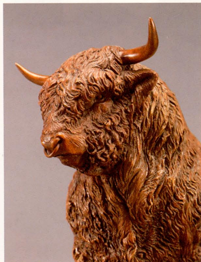
Hard, cold bronze is transformed to convey a truly lifelike impression