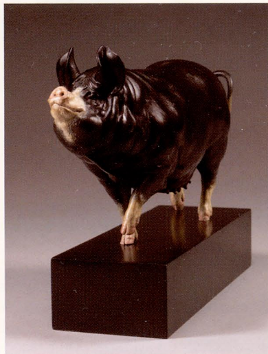
'Dittisham Lady' from Champion Animals exhibition